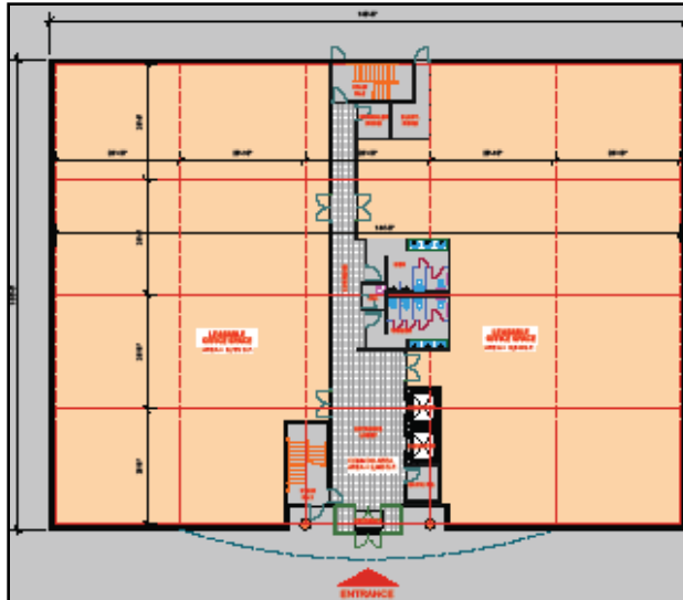
GROUND FLOOR PLAN SCALE 1 : 200